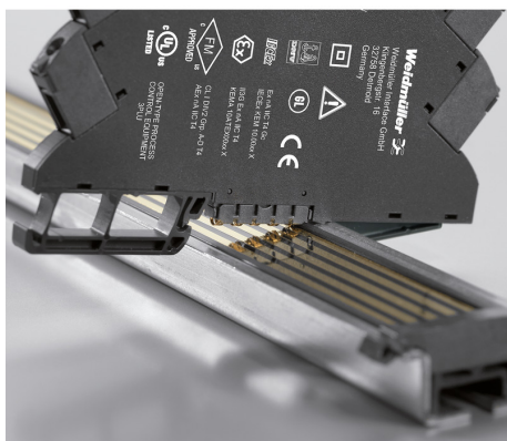
Additional power supply option via bus