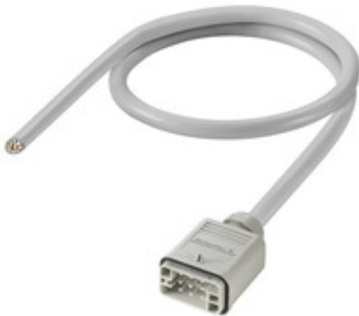
Product similar to illustration