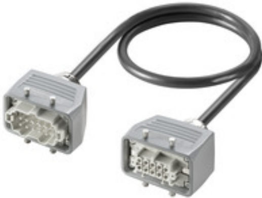
Product similar to illustration

The increasingly networked industrial world goes hand in hand with the modularization of machines and systems. Functions from the control cabinet are increasingly being moved to field level, which drives up the amount of cabling required.