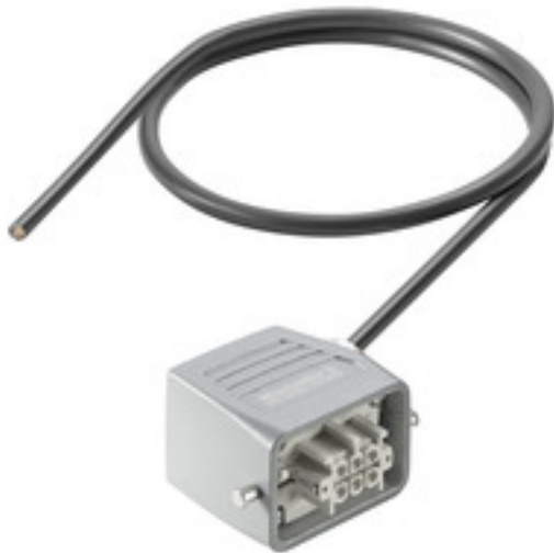
Product similar to the picture