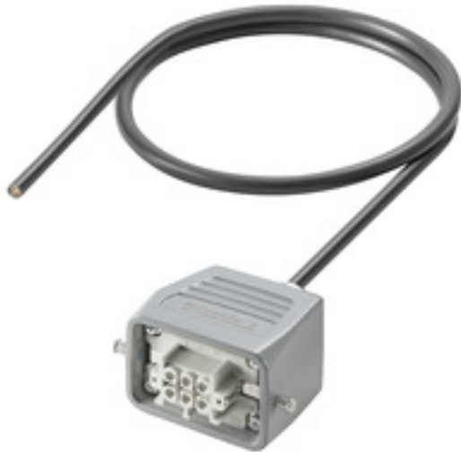
Product similar to the picture