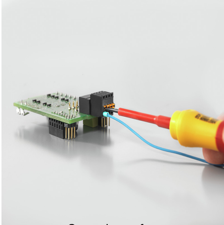
Operating safety Through PUSH IN connection system