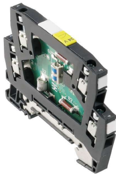
Similar to illustration